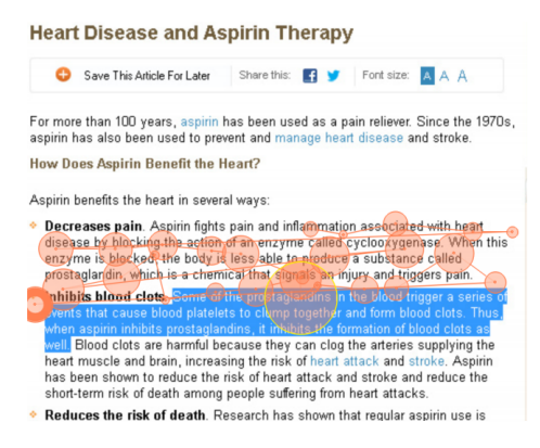
Figure 1: Eye-gaze patterns of Session 001 prior to query reformulation show strong evidence for acquisition of the medical term "prostaglandin" occurring in a paragraph of user-highlighted text.

An Eye-Tracking Study of Query Reformulation. Carsten Eickhoff, Sebastian Dungs, Vu Tran